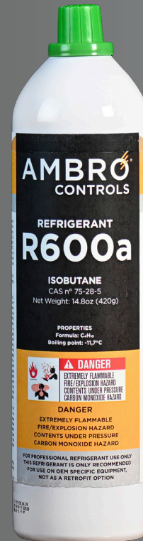
Product No. 1811290