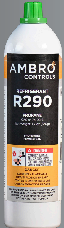
Product No. 1811600